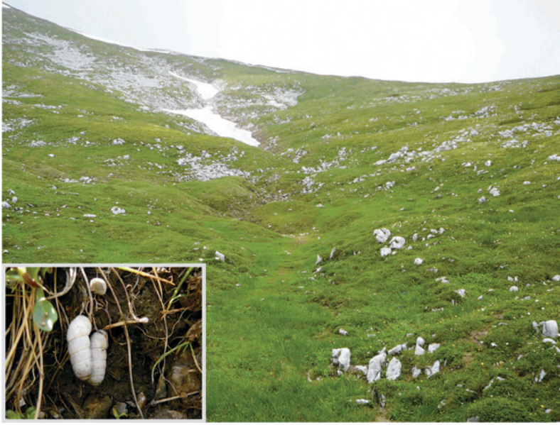
Figure 3 – Complex of Firmetum, Seslerio-Sempervivetum and Festuca-Arostis meadow is a result of strong structured relief and comprises elements of several communities of plants. In this habitat only C. obtusus is found.

from 1 076–2 179 m (Table 1). We included also localities at which both C. obtusus and T. oreinos were lacking, although they seemed to provide potential habitats of the species.