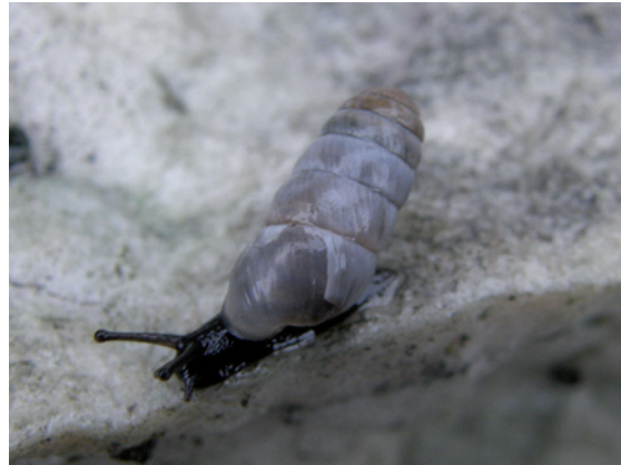
Figure 4 – Trochulus oreinos oreinos (left) and Cylindrus obtusus (right).

taxa are restricted to the subalpine and alpine ecotone, at least populations at the lower altitudinal distribution are potentially affected by climatic changes. Both taxa have few opportunities to enlarge their potential habitat upwards as they have already reached sites near the highest summit areas of the investigated mountain massifs. Below we discuss aspects of East-Alpine endemism on the basis of the ecology of T. oreinos and C. obtusus .