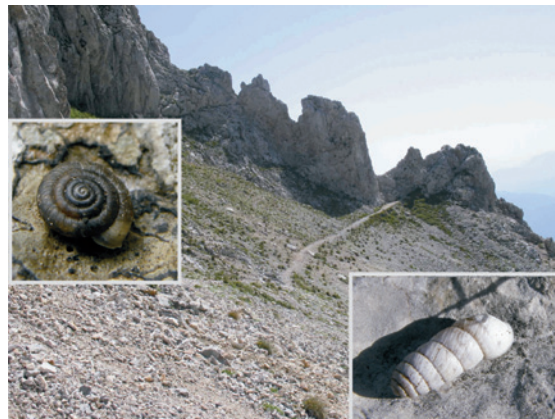
Figure 1 – Alpine boulders and screes with poor vegetation are a suitable habitat for both Trochulus oreinos (left) and Cylindrus obtusus (right).

The north-eastern Calcareous Alps are a hotspot of endemic plants and animals (Rabitsch & Essl 2009). This is also the case for land snails, which have a maximum of endemics in this area. Because of their poor dispersal abilities, they are especially predestined to develop local forms in isolated areas. Two of the endemic pulmonate land snail species of the north-eastern Alps – Trochulus oreinos (Wagner 1915) and Cylindrus obtusus (Draparnaud 1805) – which are the focus of a larger project on the phylogeography of Alpine land snails – inhabit open, rocky areas from the subalpine ecotone upwards to the alpine zone (Klemm 1974; Reischütz & Reischütz 2009). Trochulus oreinos comprises two subspecies: Trochulus oreinos oreinos (Wagner 1915), subject of the present paper, distributed in the northern Calcareous Alps of Lower Austria and Styria from Schneeberg to Totes Gebirge, and Trochulus oreinos scheerpeltzi (Mikula 1954), restricted to the Northern Calcareous Alps of Upper Austria from Sengengebirge to Höllengebirge. Cylindrus obtusus is distributed in the Northern Calcareous Alps from Schneeberg in Lower Austria, across the northern parts of Styria to Mt. Dachstein in Upper Austria and carbonate sites within siliceous bedrock of the Central Alps westwards to the Glocknergruppe. Both species are restricted to higher elevations: Trochulus oreinos from 1400 to 2200 m (Klemm 1974; Duda et al. 2010), Cylindrus obtusus from 1100 to 2680 m (Klemm