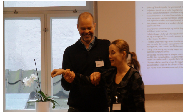
Demonstration of a security alternative

Participative decision-making is the centrepiece of the DESSI-process. Workshops in all of the three outlined phases are held with as many of the stakeholders as possible involved (e.g. experts, clients, decision-makers, citizens), who are requested to participate in discussions about a suitable security investment. Additionally, the process of decision-making is supported by a web-tool, which ensures better transparency.