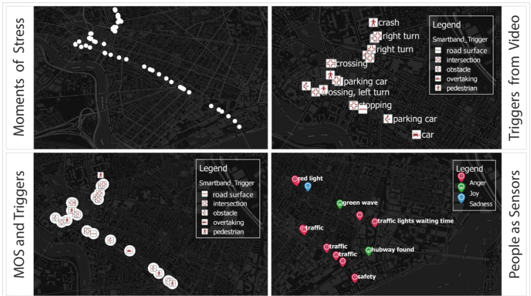
Figure 4: Comparative analysis of the data of rider 5. “Moments of stress” (MOS) show the negative arousal situations. “Triggers from video recording” identify critical situations from the GoPro Tracks. “MOS and Triggers” combines triggers from the video recording and instances of negative arousal. “People as Sensors” illustrates georeferenced, subjective, perceived emotions.

The “Moments of Stress” (Figure 4, upper-left) shows the negative arousal identified by the Smartband wristband sensor in terms of the duration of the stress events. With the help of the video analysis, critical situations can be identified in the physiological measurements. A closer look at cyclist 5’s video reveals the triggers for negative reactions in 29 situations (Figure 4, upper-right): damaged road surface, dangerous intersections, physical obstacles, overtaking, or pedestrians crossing (videos are available on Urban Emotions Youtube Channel, 2015). The lower-left map in Figure 4 shows MOS and triggers combined, representing a consolidated indicator for negative arousal.