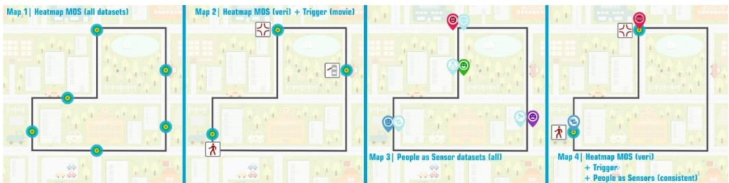
Figure 2: Schematic maps for identifying potential danger spots, combining datasets collected from all participants