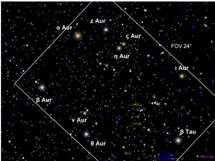
Figure 2: The proposed “Aurigae” field. It contains nine variable stars brighter than 4th magnitude. The brightest being the active binary Capella but each one represents a distinctive class of its own with a large variety of astrophysical challenges.

Shcherbakov et al. (1990) discovered a modulation of the He I 1.08\mu\text{m} equivalent width with the 104-day orbital period. This variation, and its periodicity, was later confirmed by Katsova & Shcherbakov (1998). The latter authors also concluded that the main He I-absorption line must originate in the chromosphere of the quiescent cool component, while the residual helium emission and the highly ionized iron lines are thought to be connected with a magnetized wind that originates from plages on the active hot component and then forms a shock wave in the corona of the cool component. Therefore, chromospheric emission is expected from both components.