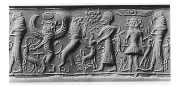
Fig. 45 Impression revealing the design on cylinder seal of Cypriot origin from Ugarit (after YoN 2006, 129, no. 9: RS 20.039). H. 2 cm, D. 1.3 cm

Egypt's religion is critical in understanding the original and extensive public role which Akhenaton