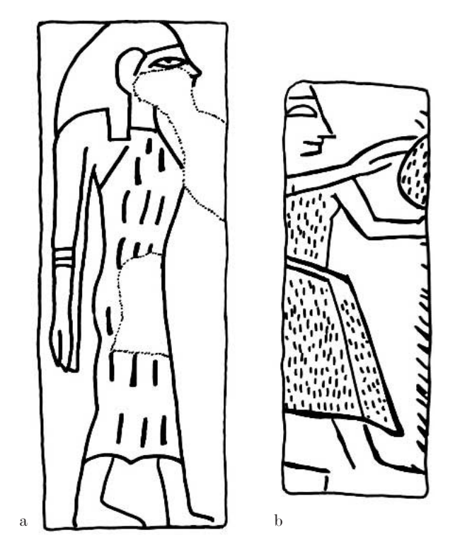
Fig. 42 Incised bone carvings from Tell el-<sup>c</sup>Ajjul and Toumba tou Skourou a) Incised bone carvings from Tell el-<sup>c</sup>Ajjul (after PETRIE 1932, pl. 24:3); b) Incised bone carving from Tomb 1 Toumba tou Skourou (after VERMEULE and WOLSKY 1990, 221, T. 1.675, fig. 117 right). L. 7.2 cms

LBA pottery assemblage from Pella in Jordan (POTTS 1992; ERIKSSON 2001b). However, this ware is also represented at Tell el-<sup>c</sup>Ajjul, Lachish (TUFNELL 1940, pl. 64:2) and many other mainland sites. Yet, interestingly there is possibly only one sherd from <sup>c</sup>Ezbet Helmi.<sup>263</sup> The most likely time for this piece to arrive in Cyprus would be in the early New Kingdom.