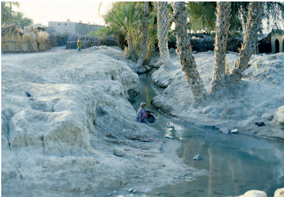
Fig. 2: A village scene in Makran (southern Baluchistan).