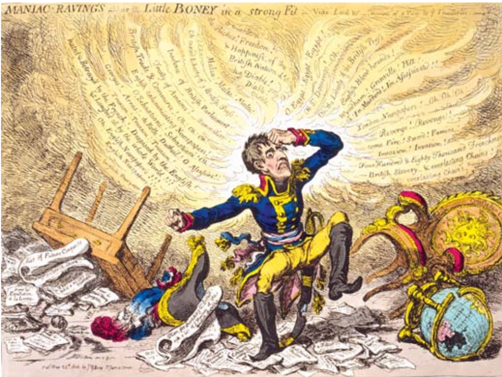
Fig. 1: “Maniac-Raving’s, or Little Boney in a Strong Fit.” Caricature of Napoleon by James Gillray (1803)