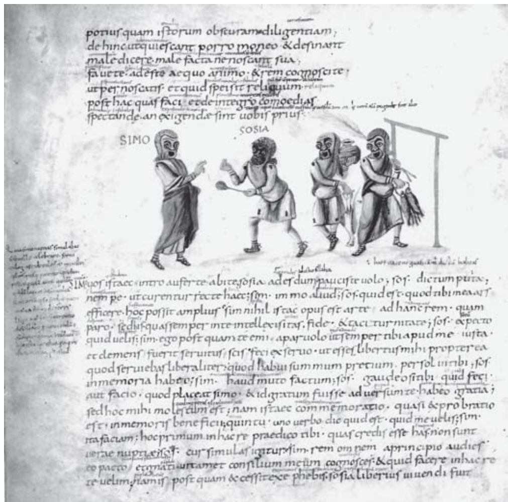
Fig. 2: Ninth-century illuminated manuscript of the Comedies of Terence. Rome, Vat. lat. 3868, fol. 4 v