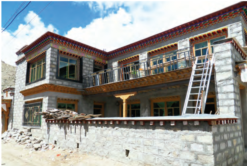
Fig. 2. One of the new constructed two-storied houses in Chun.

Along with these infrastructural and economical developments, the social hierarchies in the village also seem to have changed. People started to differentiate between families who still live on fishing and families who do not. Furthermore, they differentiate between people who go fishing for their subsistence living and those who do it for commercial reasons and work for Chinese businessmen. The new road has offered the people in Chun other sources of income. Outsiders such as tourists now find it relatively easy to reach there by road. The unique status of Chun as the only Tibetan