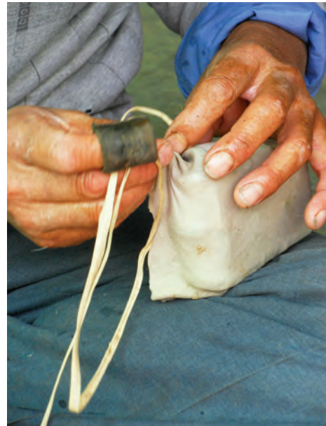
Fig. 5a, b.