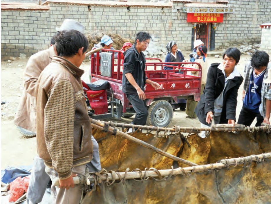
Fig. 6. Reparation of an old yak hide boat in Chun.

As a result of changing orientation towards other economic sources, both the Tibetan fishermen's handicraft and their material culture strongly connected to this profession are on the way to vanishing – yet another example of an on-going global trend. M. Estellie Smith has described this process in her book on maritime anthropology: „As the dependency on manufactured equipment increases, individuals lose the knowledge of creativity; the boats, nets, and sails, as well as the lore of sailing, weather conditions, currents, behaviour of the biomass – all are being replaced ...“ (Smith 1977: 16.). If we take a look at the fishermen of Chun, we discover that their handmade nets have now been completely replaced by industrial produced gill nets. In direct relation to this replacement, the knowledge concerning the production of traditional fishing equipment will soon be lost. If we regard fishing as an expression of technological ingenuity, we realise that the technological knowledge of using these nets to catch fish will fade out, as well as that concerning the construction process of the boats if they should also disappear one day. With the going of the boats, so too the skills of river navigation and boat-craft will disappear. It will surely be interesting to revisit the people of Chun in a generation from now to observe exactly what, if any, of this local knowledge system still remains.