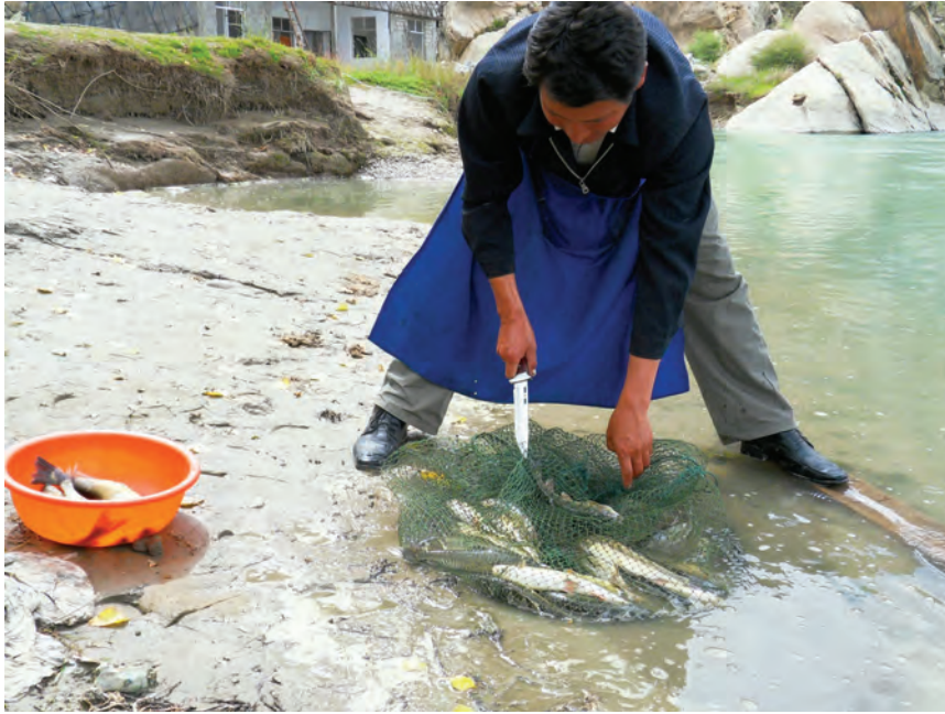
Fig. 4. A fisherman from Chun is preparing fresh fish from the river for a fish meal.