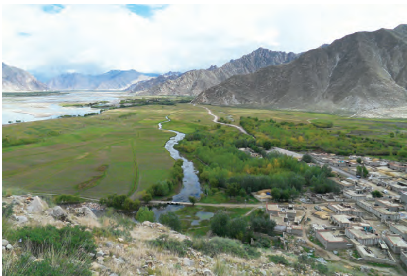
Fig. 1. Overview of a part of Chun Village and the Kyichu in the background.

With modern roads and bridges now rendering the traditional water transportation services of the Chunpa redundant, the contemporary economic life of Chun is based upon a mix of fishery, agriculture, seasonal pastoralism, and handicrafts. Apart from the fact that there is a lack of arable land in Chun, a large part of the available land is also damaged regularly by flooding of the Kyichu