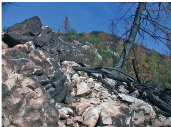
Effects of fire on a sub-alpine dwarf pine ecosystem in the Austrian Alps.

the first to recolonize the site. Hypogastrura cf. assimilis is described as a eurytopic species, Parisotoma notabilis is one of the most ubiquitous species and Mesaphorura sylvatica also occurs widely, both are found in all kinds of habitats. None of these species is specific to the early stages of the succession (few studies have investigated succession of Collembola in the Alps). Folsomia penicula , Mesaphorura sylvatica and Parisotoma notabilis were the dominant species of the 50-year old burned site. In the future it should be investigated if this is a stable climax community. Folsomia penicula is described as mesophilic, is mostly a forest species and usually found in high abundances. Mesaphorura sylvatica , Xenylla sp. and Isotomiella minor are the dominant species of the undisturbed site and this should be part of a stable climax community. Xenylla sp. was not identified to species level (it may be a new species) so we cannot say anything about its ecology. Both Mesaphorura sylvatica and Isotomiella minor are not typical Alpine species. Isotomiella minor is also described as one of the most ubiquitous species and occurs in all kinds of habitats. After Deharveng (oral comm. at the Aperygota conference in Siena, September 2010), Parisotoma notabilis and Isotomiella minor each are probably a group of species.