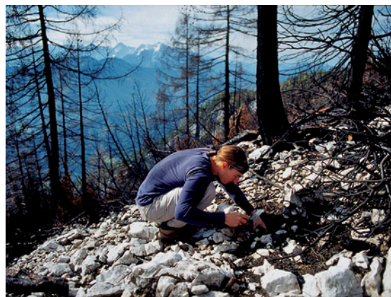
Field work on a burned site in the Austrian Alps.

Certini (2005) reviews the effects of fires on the forest soil and distinguishes between 1) low to moderate fires and 2) severe fires. Most prescribed fires are of low intensity and can be used as a management tool without long-term effects on organism density and composition. Wildfires, on the contrary, are often of high intensity, occur during dry periods and have much larger and even irreversible effects on the ecosystem. Certini (2005) concludes that if plants succeed in recolonizing a burned site soon after the fire, the pre-fire conditions can recover within a short time. Neary et al. (1999) give a general review on the effects of fire on belowground systems and describe the physical, biogeochemical and biological effects. Low impact fires can encourage herbaceous flora, increase plant available nutrients and thin out overcrowded forests. Severe fires, on the contrary, change the mineralization rate, alter C to N ratios, influence above- and belowground species composition, decrease the micro- and macro-