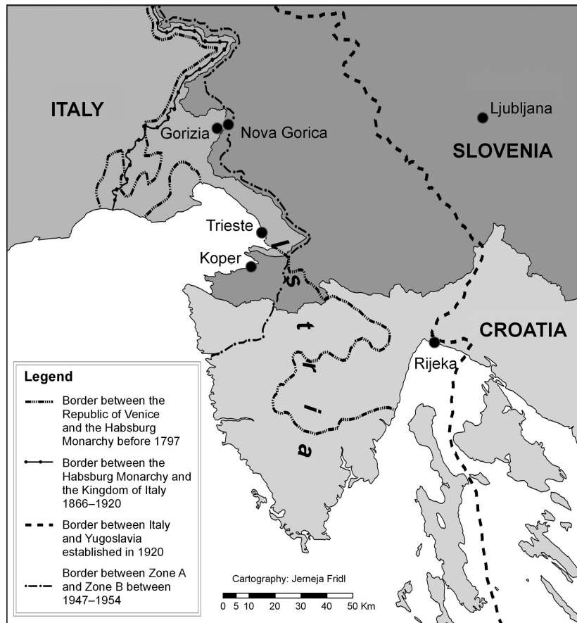
Fig. 1: The Istrian Peninsula lies at the northeast end of the Adriatic Sea at the junction of the Balkans, the Mediterranean, and Central Europe. It has had a tumultuous and vibrant history due to frequent border changes.