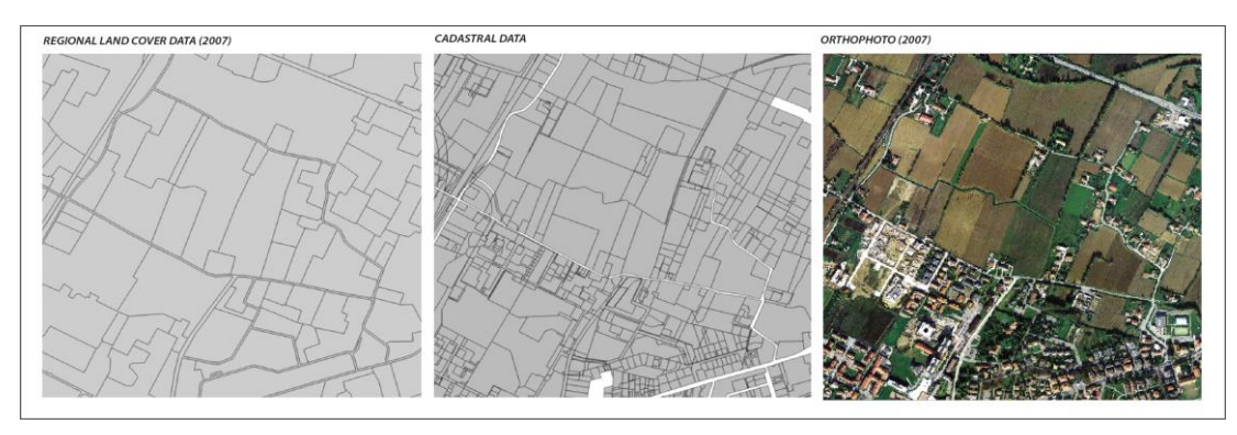
Figure 2: Comparison of the spatial resolution of available vector data and orthophoto