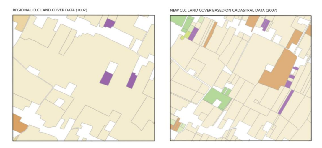
Figure 4: Comparison between the regional land-cover data and the new database

Figure 3: Land cover of the agricultural areas based on cadastral data for the year 2017