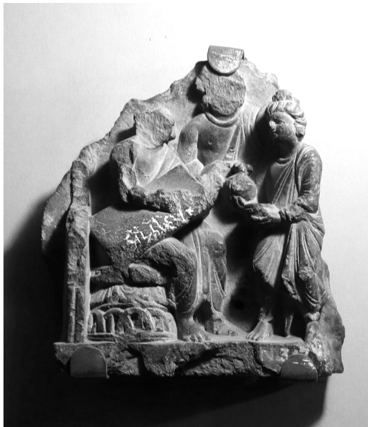
Figure 2: The young Buddha (right) approaches his seated teacher in the classroom to show him his writing tablet. Gandhara, exact provenance unknown. Peshawar Museum, access no. 2737.