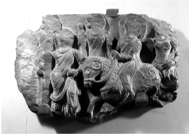
Figure 1: The young Buddha goes to school on a ram. Sahri Bahlol, Pakistan, second to third century CE. Peshawar Museum, access no. 3736.