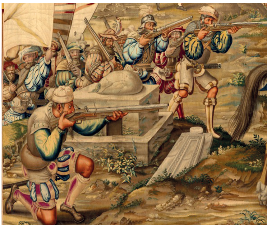
Fig. VI.8: Jan Cornelisz Vermeyen/ Real Fábrica de Tapices de Santa Bárbara, Madrid, Skirmishes on the Cape of Carthage, tapestry IV, detail, 1731–44. Copy after the Conquest of Tunis Tapestries, after the workshop of Willem Pannemaker, 1543–54. Silk and wool. Salón de los Tapices, Real Alcázar, Seville.