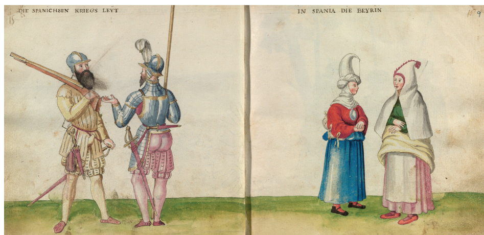
Fig. VI.10: Spanish Soldiers. Códice de trajes , second half of sixteenth century. Pen and gouache on paper, 20 x 40 cm. BNE, MS RES/285, ill. 9. Copy after Sternsee’s Album , c. 1548–49. MSF, Cat. 2025, ill. 23.