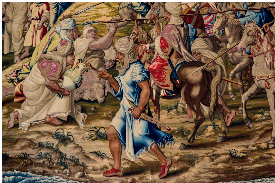
Fig. VI.5: Jan Cornelisz Vermeyen/ Real Fábrica de Tapices de Santa Bárbara, Madrid, The Capture of Tunis, tapestry IX, detail, 1731–44. Copy after the Conquest of Tunis Tapestries, after the workshop of Willem Pannemaker, 1543–54. Silk and wool. Salón de los Tapices, Real Alcázar, Seville.