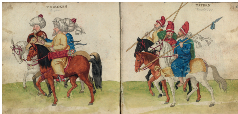
Fig. VI.7: Turkish and Tatar Soldiers. Códice de trajes , second half of sixteenth century. Pen and gouache on paper, 20 x 40 cm. BNE, MS RES/285, ill. 62. Copy after Sternsee's Album , c. 1548–49. MSF, Cat. 2025, ill. 156.