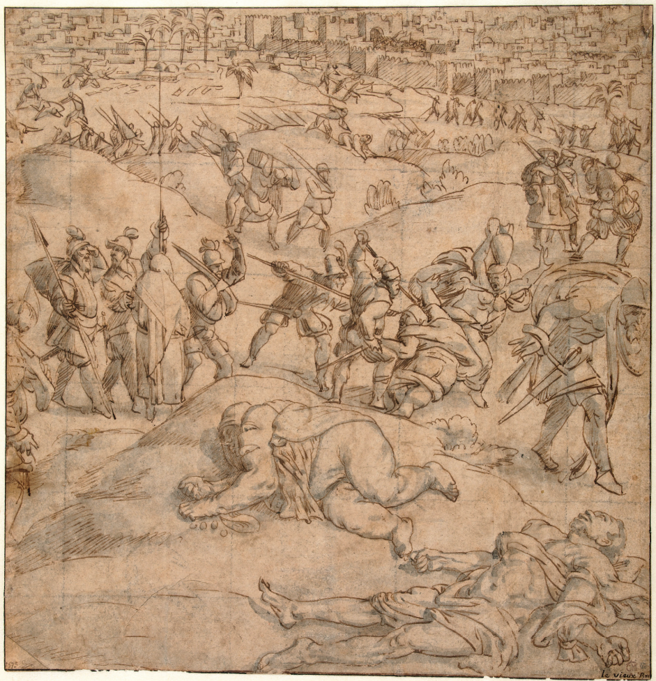
Fig. VI.3: Jan Cornelisz Vermeyen, Battle Scene at Tunis , 1540–50. Pen and ink drawing, 355 x 345 mm. Rijksmuseum, Amsterdam, RP-T-1963-265.

Sternsee described each campaign event from the pre-battle preparations to the siege of Goleta and the sack of Tunis. On 14 June 1535 the imperial fleet sailed for Goleta, the port entrance to Tunis. The ships' artillery pounded the fortress of Goleta until it was stormed and captured. 49 As the imperial troops descended upon Tunis, civilians were slaughtered, shops and mosques plundered,