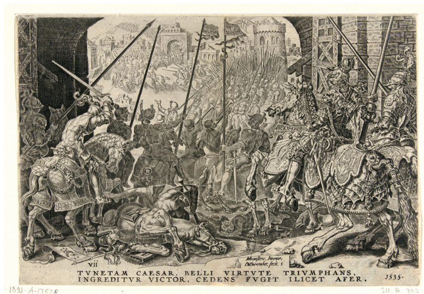
Fig. VI.2: Dirk Volkertsz Coornhert after Maarten van Heemskerck, The Fall of Tunis, 1559 . Engraving, 168 x 245 mm. From the series The Victories of Emperor Charles V . Rijksmuseum, Amsterdam, RP-P-1892-A-17528.

chief among them the imperial chancellors Mercurino di Gattinara and Alfonso de Valdés. 35 The expansionist sentiment of Charles's personal device of the Pillars of Hercules (the cliffs flanking the Strait of Gibraltar) with the motto Plus Ultra (further beyond) was, from its inception, bound up with the religious ideals of the Order of the Golden Fleece, for whom Charles had become grandmaster in 1516. As Andrew C. Hess noted, the Strait of Gibraltar not only symbolised the Ibero-African frontier but was the imagined site of a cultural division between Islam and Latin Christendom. 36 The physician Luigi Marliano explained the device at the meeting of the Order that year: it showed that a single monarch ruled over the entire world; Charles was offered a unique opportunity to “unify Christians for the protection and expansion of the faith and the recovery of Africa and Asia”; and, finally, Charles as “a new Hercules or an Atlas” would uphold his global hegemony. 37