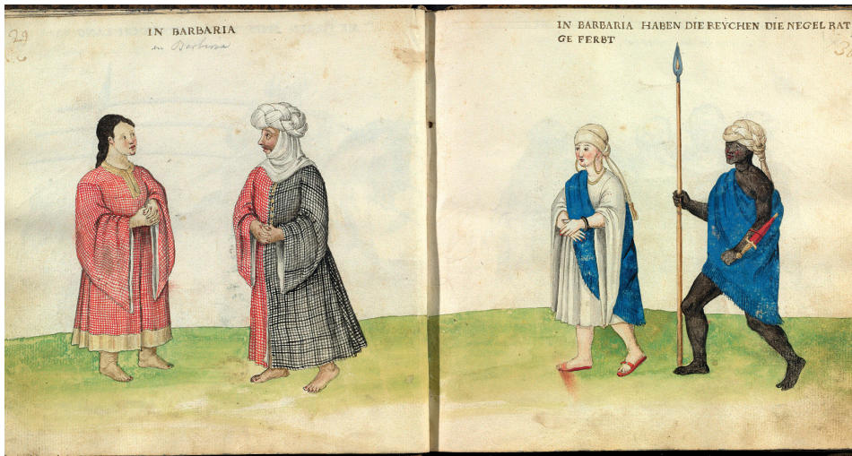
Fig. VI.6: Civilians of ‘Barbary’. Códice de trajes , second half of sixteenth century. Pen and gouache on paper, 20 x 40 cm. BNE, MS RES/285, ill. 16. Copy after Sternsee’s Album , c. 1548–49. MSF, Cat. 2025, ills. 49–50.

“rich burghers” of Barbary and Haidt (Haïdra), are shown in conversation. 59 The Album identifies racial distinctions here, too, contrasting male citizens with pale, pink skin against a black woman who, despite her gold jewellery, stands apart from the group. Following Charles V’s reinstatement of Mulay Hasan, it made sense for Habsburg allies to want to see a flourishing, well-ordered society free from Turkish control. Habsburg associations with the Hafsîd dynasty were maintained. In July 1542 Sternsee documented the arrival of Tunisian ambassadors in Spain bearing gifts for the emperor and in February 1548 he noted the visit to Augsburg by the new king of Tunis. 60