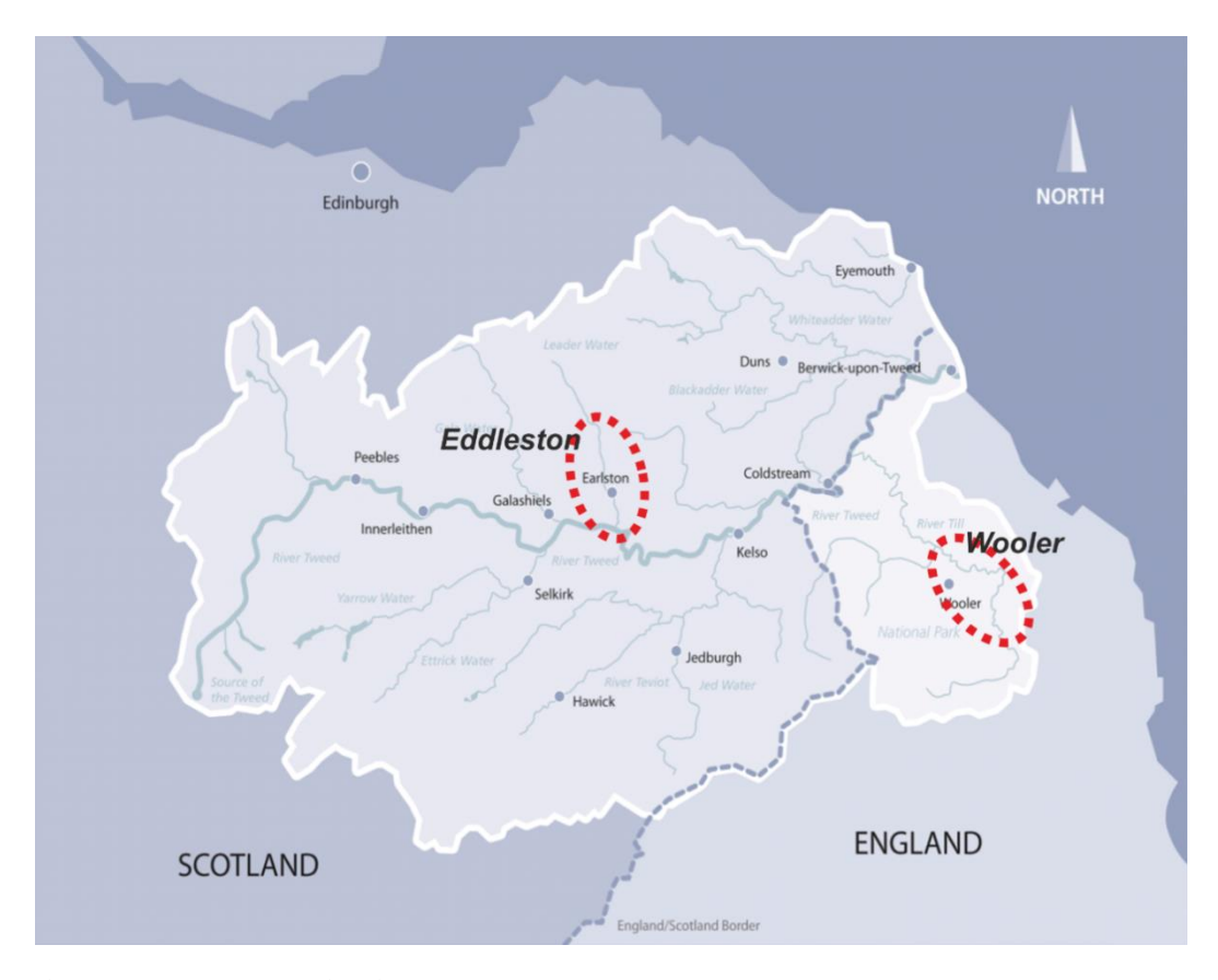
Figure 1: Case study locations in the Tweed catchment

Methodologically, this community mapping approach involved generating base maps of aerial photography overlaid with relevant cartographic data of contours and place names (printed at A0 size, 84 cm by 119 cm) for each community, one of the whole sub-catchment, and the other in more detail for the urban area. This combination of colour imagery with cartographic references was particularly useful in the solution-generation process as it facilitated orientation and identification of key locations and current land covers.