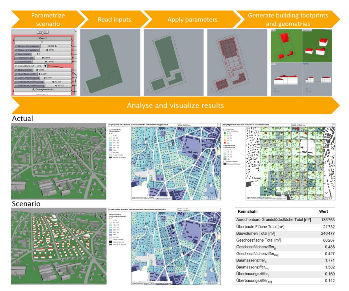
Figure 2: Illustration of the model application and selected outputs

Based on the sensitivity analysis of the model, Table 1 summarizes the observed influences of input parameters on density ratios in terms of the strength and direction of the influence. The tendencies were in line with expectations based on the analysis of the scenarios for the expert review. In the expert workshop, these results and tendencies were judged to be comparable with those of previous models. Furthermore, the experts evaluated as good the approximation of actual interrelations between building laws and density indicators. However, due to some weak points in the parametric model, the results showed lower than expected densities under certain conditions. The lack of consideration of floor areas in the roof storey and the too-generous application of the major border setbacks were identified as reasons. On narrow, elongated plots, those setbacks also lead to unrealistic building shapes that should be avoided.