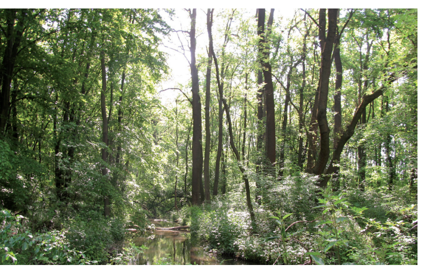
Figure 2 – Floodplain forest of Soutok, work of generations of foresters.