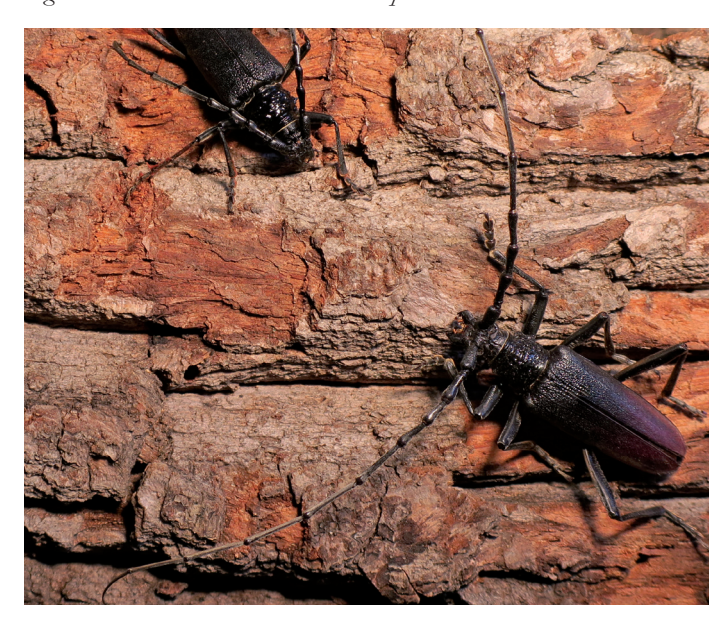
Figure 3 – Cerambix cerdo

Academy of Sciences and led by E.C.O. – Institut für Ökologie, to which colleagues from BP Wienerwald contributed, was a plan for the DMBR's revised zonation. The plan stressed the importance of implementing practical experience from abroad, including feedback from the UNESCO MAB Programme, and of the active involvement of all stakeholders. Another international project, Management of Natural Resources in the Tropics and Subtropics – Innovation in Study Programmes at Mendel University, Brno, linked DMBR with Mendel University and other partners. The project modified the former, purely forestry-oriented approach to university education towards a broader environmental scope at landscape level, using two BRs, DMBR (Czech Republic) and Socotra BR (Yemen), as examples. The study programme introduced the specific aspects of natural resources management in tropical and subtropical regions and offered comparison with cultural landscape management in Central Europe. In the course of the practical training module, students carried out field projects in collaboration with indigenous inhabitants and employees of Socotra BR. The project