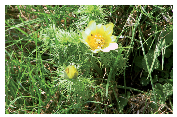
Figure 2 – Adonis vernalis

Ever since its approval, the DMBR has taken its membership of the large international family of BRs very seriously. Its first international presentation took place during the EUROMAB conference in Austria, in 2005, co-organized by the BP Wienerwald. From this starting point, the DMBR became deeply embedded in the World Network of BRs. It would be difficult to mention all international activities, but close links with Austria, for example, have resulted in frequent consultations on various matters (e.g. zonation), and in the international Czech-Austrian project Transboundary information exchange for revision and functional improvement of zonation in the Lower Morava Biosphere Reserve. The output of this project, co-funded by the Austrian