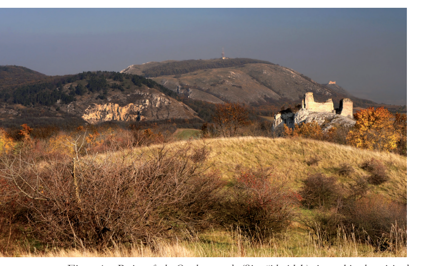
Figure 1 – Ruins of the Orphan castle (Sirotčí hrádek) situated in the original Pálava BR